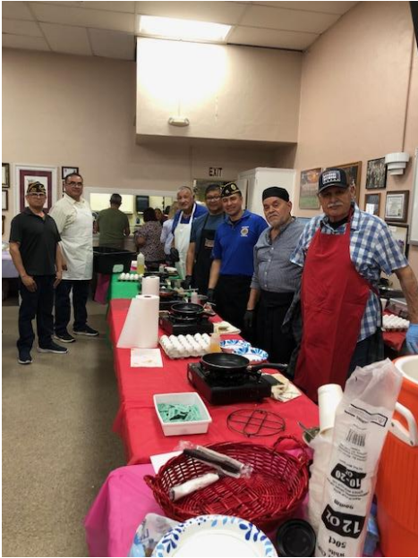
Cooks and helpers, Food served in kitchen

Post 2967 and Auxiliary members, American Legion and Community Groups helped raise funds for the fire victims. Served 230 Breakfasts. Raised over $4,000 Plus, and still receiving donations. Auxiliary 2967 Donated $300 to Holy Family Church, fire victims in Pasadena. Auxiliary Girl Scouts troop 2225, Collected Water, juices, Dry goods and clothing for the Fire victims and took it to the YMCA in San Pedro.